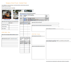
Task 2 - Guided